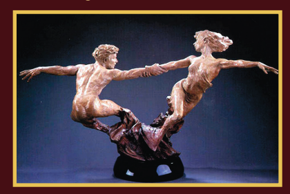
Martin Eichinger Whirlwind, Bronze, ED/100, 37" x 59"