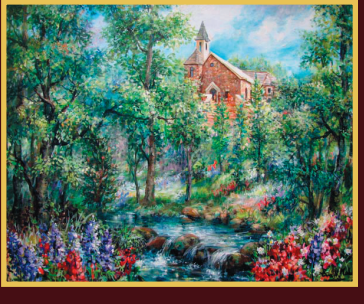
Eva Makk Chapel In Spring, 24" x 30"