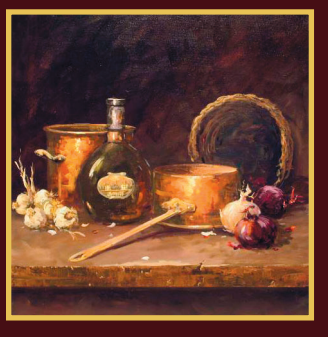
JERRY GEORGEFF Portuguese Pots, 24" x 24"