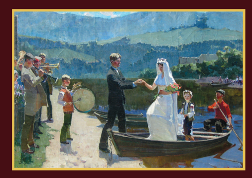
VLADIMIR I. SINGAEVSKY, Wedding Boat Party C. 1960, Oil on Canvas, 64" x 92"