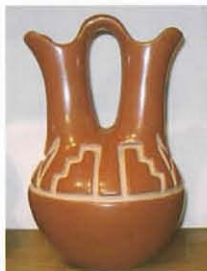
Lu Ann Tafoya, Santa Clara red wedding vase carved pottery , 7½ x 13"