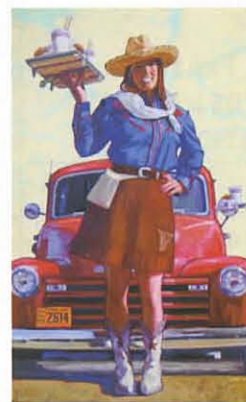
Cowgirl Car Hop , oil on canvas, 60 x 36"

Gallery 822 , 822 Canyon Road, Santa Fe, NM, 87501, (505) 989-1700