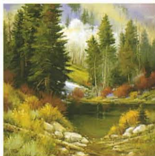
Softness of Spring , oil, 40 x 40"