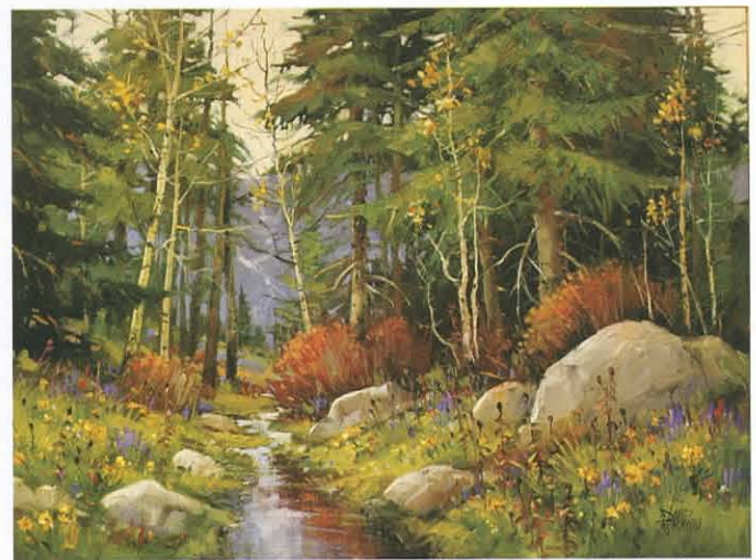
Essence of the Forest , oil, 30 x 40"