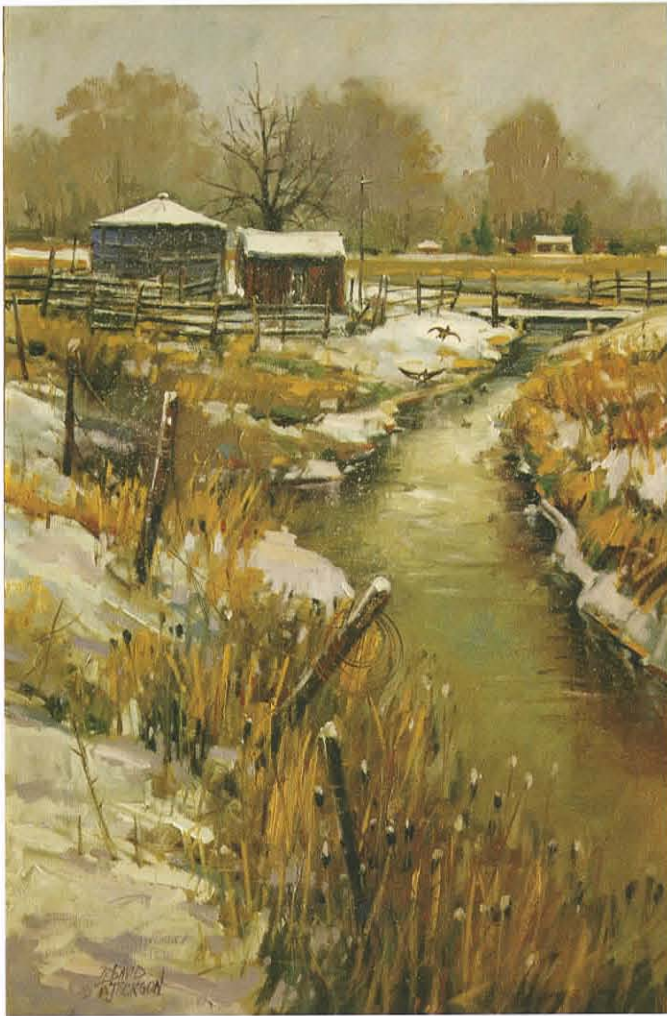
Soft Winter , oil, 36 x 24"