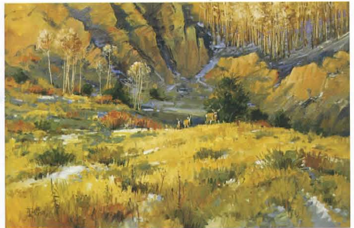
Shadows of Riley's Canyon , oil, 24 x 36"