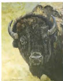
Bring Back the Bison , oil, 24 x 20"