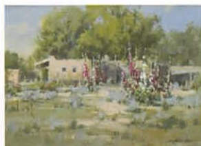
Hollyhock Season , acrylic, 12 x 16"