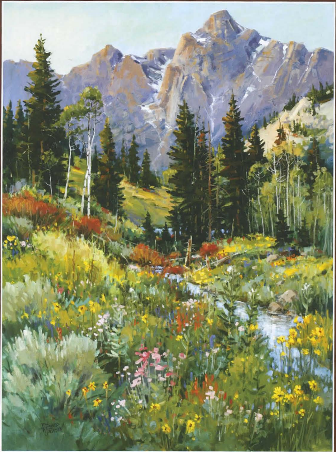
Rocky Mountain Springtime, 48 x 36, oil