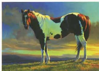
Blue Island Stallion , oil, 20 x 28"