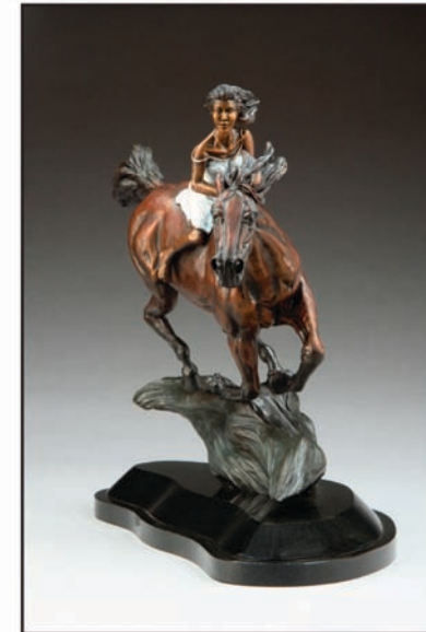
Against The Wind" 18" H x 21 W"