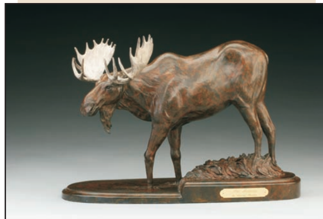
His Majesty 14" H x 17" W