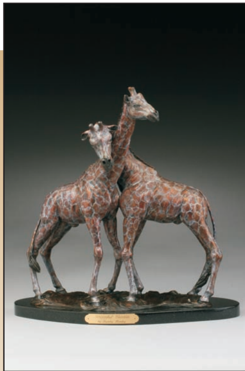
Graceful Giants 16" H x 15" W