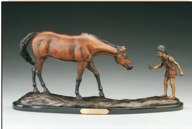
Making Friends 11 1/2" H x 23" W