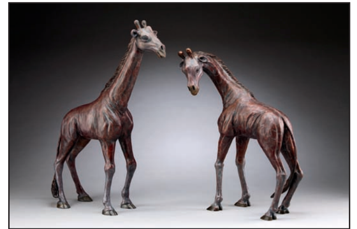
Gentle Souls 37" H x 25" W