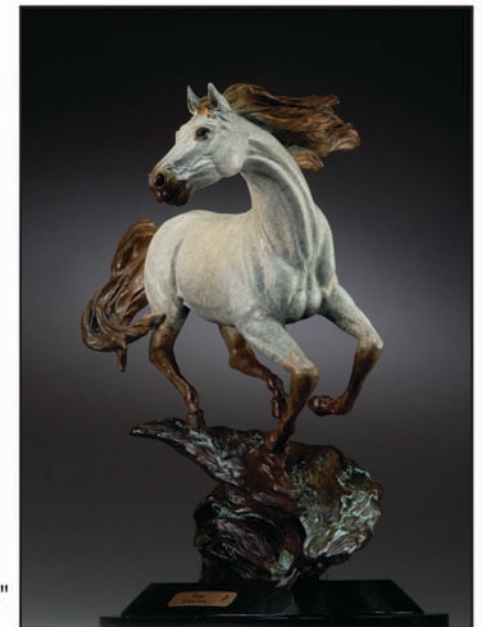
"Escape" 21"H x 19 W"