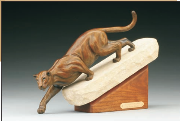
Canyon Stalker 10" H x 19" W