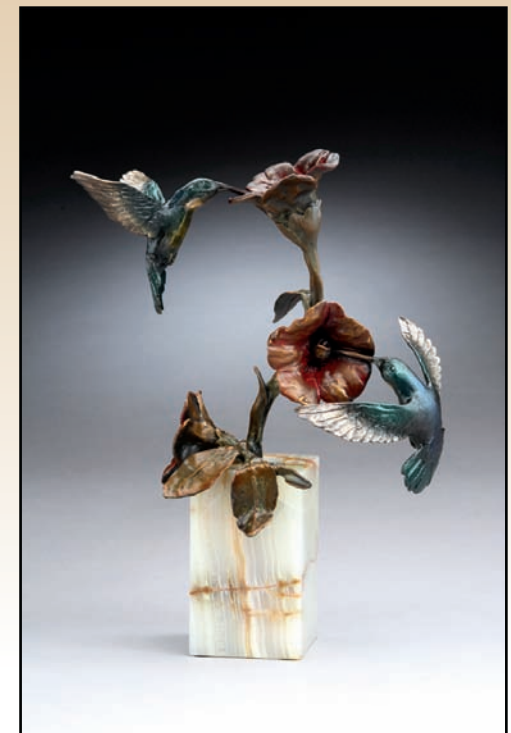
Tis So Sweet 14" H x 11" W